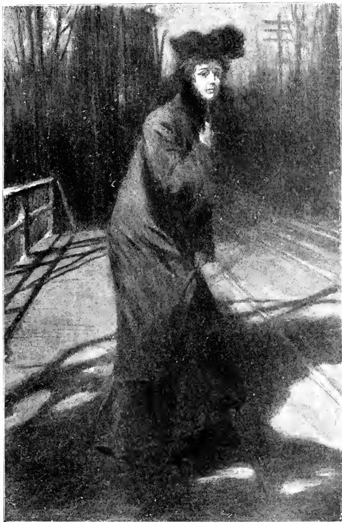
"SHE STOOD STARING DOWN THE TRACK AT THE UNSWERVING SIGNAL-LIGHTS"